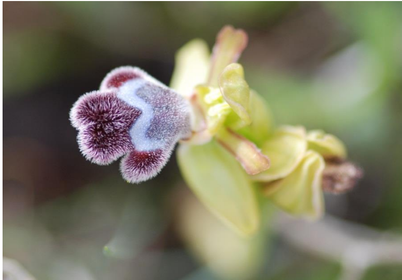
Ophrys fleischmanii at Prina